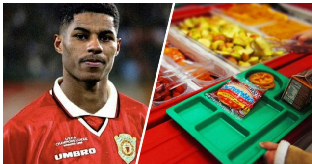
Marcus Rashford's Campaign for Free School Meals

What do they say, "never mix Religion and Politics?" But sometimes these two worlds do overlap. Indeed, the more I discover about the historical Jesus and the wider context in which He lived and shared His message the more convinced I am that He knew and cared passionately about the life and times of the ordinary people of Northern Galilee amongst whom He lived, and laughed, and loved.