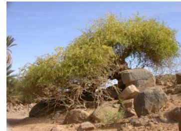
A Mustard Tree in Israel – “Salvadora Persica,” growing to about 8-10ft tall.

However, those who are keen observers will have noticed, Jesus goes on to say, in verse 32, “Yet when planted, it grows and becomes the largest of all garden plants, with such big branches that the birds can perch in its shade.”